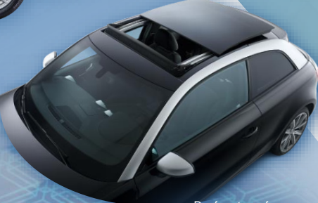
Roof systems for autonomous driving