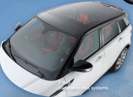
Fixed panoramic roof systems