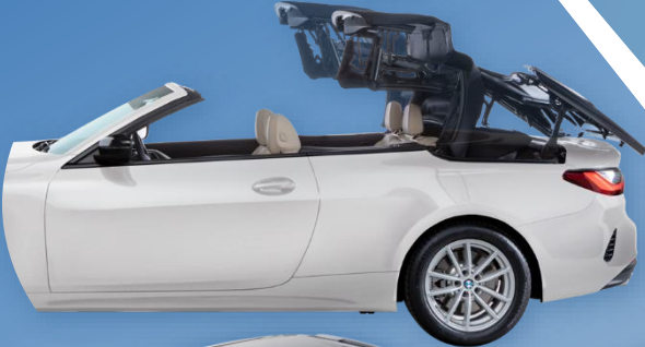
Convertible roof systems