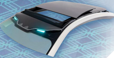
Roof systems for autonomous driving